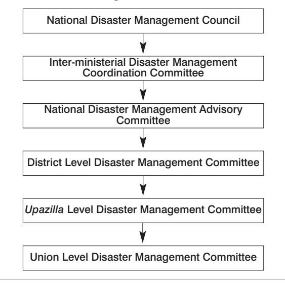
Figure 2: Structure of the Disaster Management Committees at different levels

the Minister of the Ministry of Disaster Management and Relief, MoDMR), which holds informal meetings with the Prime Minister for necessary direction if required. The national council and committees are responsible for policy formulation and coordination of disaster management at national, regional and local levels. The committees become active to address the disaster situation immediately. Interaction from the ministry to the union levels is very prompt and effective: management, good practice, coordination and mobilisation are effective among the committees and they respond quickly to communities.